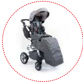
winter sleeping bag