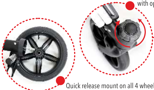
Quick release mount on all 4 wheels