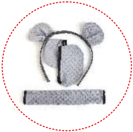
GRIZZLY BEAR set