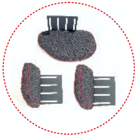
head / torso / hips adjustable pads