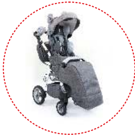
GRIZZLY BEAR set