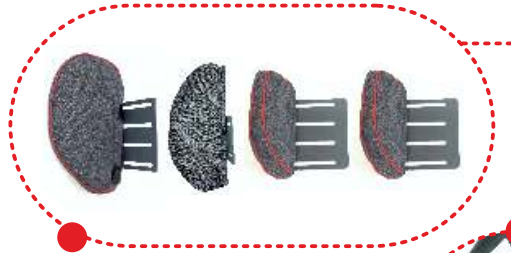
hips / side / torso / head pads