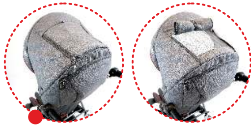
Canopy with window