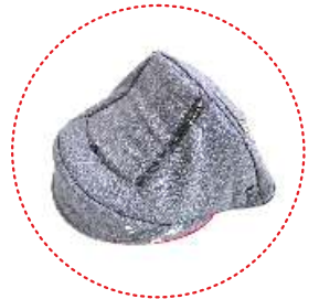
canopy with window