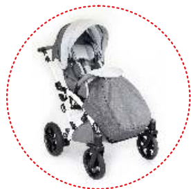
winter sleeping bag