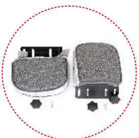
head / torso adjustable pads