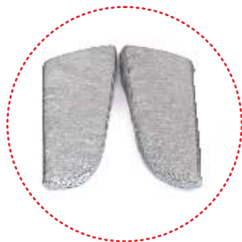
seat minimizing kit