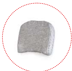
seat minimizing kit