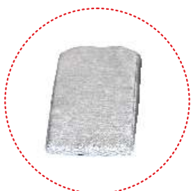
seat minimizing kit