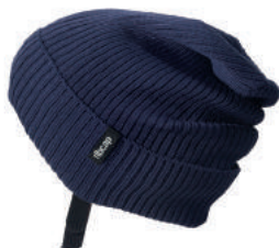
Special Order only MARINE