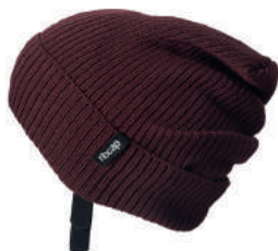
Special Order only BORDEAUX