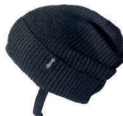
Special Order only ANTHRACITE