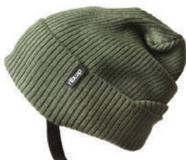
Special Order only KHAKI

extra large ø 62–65cm (only for grey and anthracite)