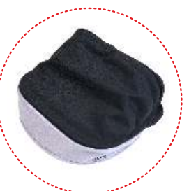
canopy with window