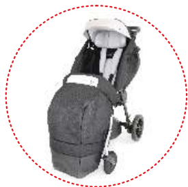
winter sleeping bag